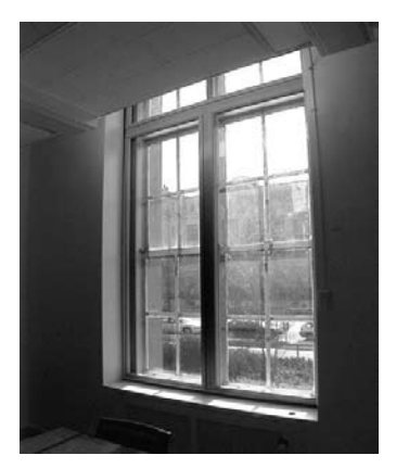
FIGURE 6 Interior views of blastresistant storm windows. They are designed to contain flying debris, preserve the historic character of building exteriors and interiors, admit daylight, offer energy savings and, with operable product options, allow fresh air inside the building. (Oldcastle-Aral, Inc.)

FIGURE 5 Blast shade detail showing fabric anchored to the window frame to contain glass fragments and sash units. Shades can be designed to conform to the contours of arched windows and other unusual openings. (GSA)