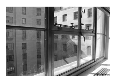
FIGURE 8 Detail views of historic windows retrofitted with laminated glass containing film to resist glass fragmentation and reduce heat gain.

Larger, simpler sash may accept replacement glazing and improve thermal performance without substantially changing the window profiles and detailing. Fanlights and sidelights to exterior historic doors can be similarly retrofitted for improved blast resistance and thermal performance, but as these features are at eye level, the integration of films, new glazing, or panels should be carefully detailed. Overhead skylights and interior lay lights or decorated stained glass should also be reinforced with some measure of protective film or secured glazing to protect persons below.