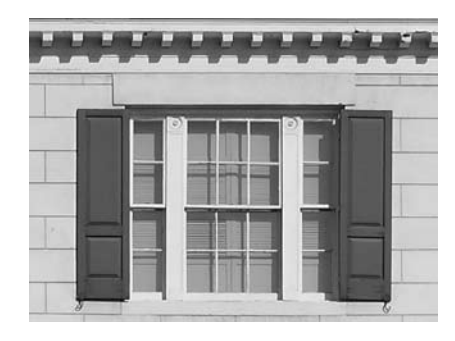
FIGURE 3 Exterior view of 19th century windows repaired and retrofitted with weather-stripping to reduce air infiltration. Properly maintained, some old growth wood sash windows have demonstrated life cycles exceeding 200 years.

Installing weather-stripping and sealing gaps between walls, window frames, and sash to reduce infiltration is one of the most cost-effective ways to achieve substantial energy savings for a small investment. Weather-stripping typically uses a thin, bendable strip of metal such copper to fill the gap between the door or window sash and frame to exclude cold or unconditioned air. Interior shades and blinds complement infiltration- reducing measures by controlling heat gain. Some products include sensor-driven operating mechanisms that respond to changing daylight conditions. These alternatives are regarded as maintenance repair, from a regulatory standpoint, and require no Section 106 review—a benefit for projects with a limited project delivery schedule.