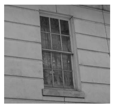
FIGURE 2 As part of every window assessment survey, the presence of rare, costly or difficult to replicate materials, such the wavy historic cylinder glass reproduced for these mid-19th-century windows, must be identified as features requiring a window retrofit approach rather than replacement.

Any changes that will permanently alter or remove historic features or materials require a compelling justification supported by a systematic and building-specific analysis that takes into consideration preservation goals as well as window performance goals.