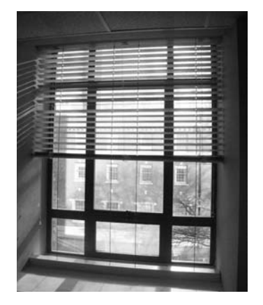
FIGURE 4 Used in conjunction with glazing film, blast blinds retain historic windows while providing improved thermal efficiency and blast protection. Supporting cables are anchored at the top and bottom of the window frame, so blinds can be opened and closed, not raised or lowered. (GSA)

Some storm window products have size constraints that may require designing multiple storm windows with carefully aligned muntins for windows exceeding a given size threshold. The ability of the existing window frame to support added storm sash containing laminated glass must also be confirmed. Some frames will require structural reinforcement. Sash access for cleaning and maintenance must also be considered.