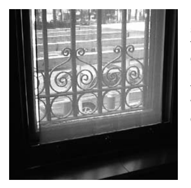
FIGURE 5 Blast shade detail showing fabric anchored to the window frame to contain glass fragments and sash units. Shades can be designed to conform to the contours of arched windows and other unusual openings. (GSA)

FIGURE 4 Used in conjunction with glazing film, blast blinds retain historic windows while providing improved thermal efficiency and blast protection. Supporting cables are anchored at the top and bottom of the window frame, so blinds can be opened and closed, not raised or lowered. (GSA)