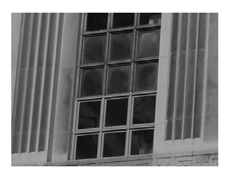
FIGURE 11 Exterior before (top two rows) and after (bottom two rows) views showing original windows and blast resistant replicas illustrates minor muntinwidening needed to secure the thicker laminated glass of the new blast window.

The slender profiles of some muntins cannot be replicated when blast or inulated glass windows are required. Energy and blast glazing composites are often thicker than single pane glazing, requiring larger muntins and stops to hold the thicker assembly in place. True-divided light (TDL) windows have, in the past, been generally preferred for replicating historic multi-paned windows, but simulated divided light (SDL) sash when properly crafted can produce a convincing effect. SDL use spacers between the panes of the insulated unit, aligned with three-dimensional muntin-grids on the interior and exterior glass surfaces. Keeping the surface grid permanently tight to the surface is critical for effective simulation and can be difficult on very large pieces of glass. SDL offer greater flexibility for matching historic muntin profiles, allowing even narrow muntins to be replicated with insulated units. When replicating any divided light window, specify that replacement windows must match the depth, width and profile of the original window muntins. The addition of insulated glass without the use of a deeper sash will, however, necessitate some compromise in the depth of profiles, and such compromises should generally be made at the interior face.