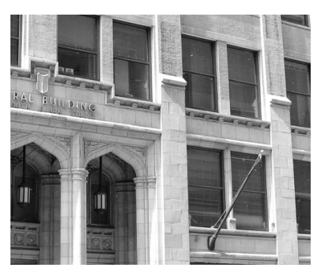
FIGURE 10 Exterior view of blast windows fabricated with custom muntin placing upper and lower panes in separate planes to simulate the appearance of double hung windows.

The slender profiles of some muntins cannot be replicated when blast or inulated glass windows are required. Energy and blast glazing composites are often thicker than single pane glazing, requiring larger muntins and stops to hold the thicker assembly in place. True-divided light (TDL) windows have, in the past, been generally preferred for replicating historic multi-paned windows, but simulated divided light (SDL) sash when properly crafted can produce a convincing effect. SDL use spacers between the panes of the insulated unit, aligned with three-dimensional muntin-grids on the interior and exterior glass surfaces. Keeping the surface grid permanently tight to the surface is critical for effective simulation and can be difficult on very large pieces of glass. SDL offer greater flexibility for matching historic muntin profiles, allowing even narrow muntins to be replicated with insulated units. When replicating any divided light window, specify that replacement windows must match the depth, width and profile of the original window muntins. The addition of insulated glass without the use of a deeper sash will, however, necessitate some compromise in the depth of profiles, and such compromises should generally be made at the interior face.