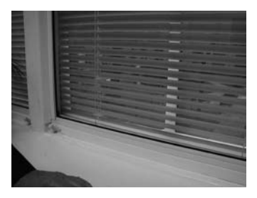
FIGURE 7 Detail views of demountable blast-resistant, thermal storm windows with built-in blinds to control daylight.

FIGURE 6 Interior views of blastresistant storm windows. They are designed to contain flying debris, preserve the historic character of building exteriors and interiors, admit daylight, offer energy savings and, with operable product options, allow fresh air inside the building.