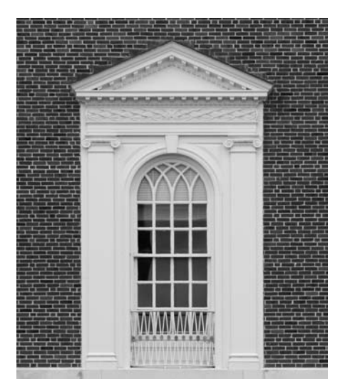
FIGURE 1 Windows are character-defining features in every historic public building. Stone quoins, lonic pilasters and carved pediments frame multilight, arched windows defining this Georgian revival facade.

Replacement of historic windows raises preservation and environmental issues requiring more extensive planning, analysis and mitigation to justify the substantial loss of historic materials. Studies exploring historic window replacement need to examine window conditions throughout the building and consider alternatives that preserve as many historic windows as possible. This might entail replacing only irreparably deteriorated windows or consolidating sound windows on principal facades or lower stories most visible to pedestrians.