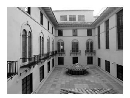
FIGURE 12 Thoughtful analysis to balance GSA preservation, cost, and performance goals supported historic window retention with replacement of non-historic windows at this 1930 courthouse. Blast-resistant, thermal storm windows were installed where original windows remained on courtrooms and the up-

When analysis strongly supports replacement of window sash or entire window units, consideration must also be given to the feasibility of a combination preservation and replacement approach that retains in place or relocates intact original windows to the building's primary facades or most visible locations (e.g. lower floor levels). As a Section 106 mitigation measure, some GSA projects have preserved sound original windows by consolidating them on the building's lower levels or replacing windows on secondary facades only.